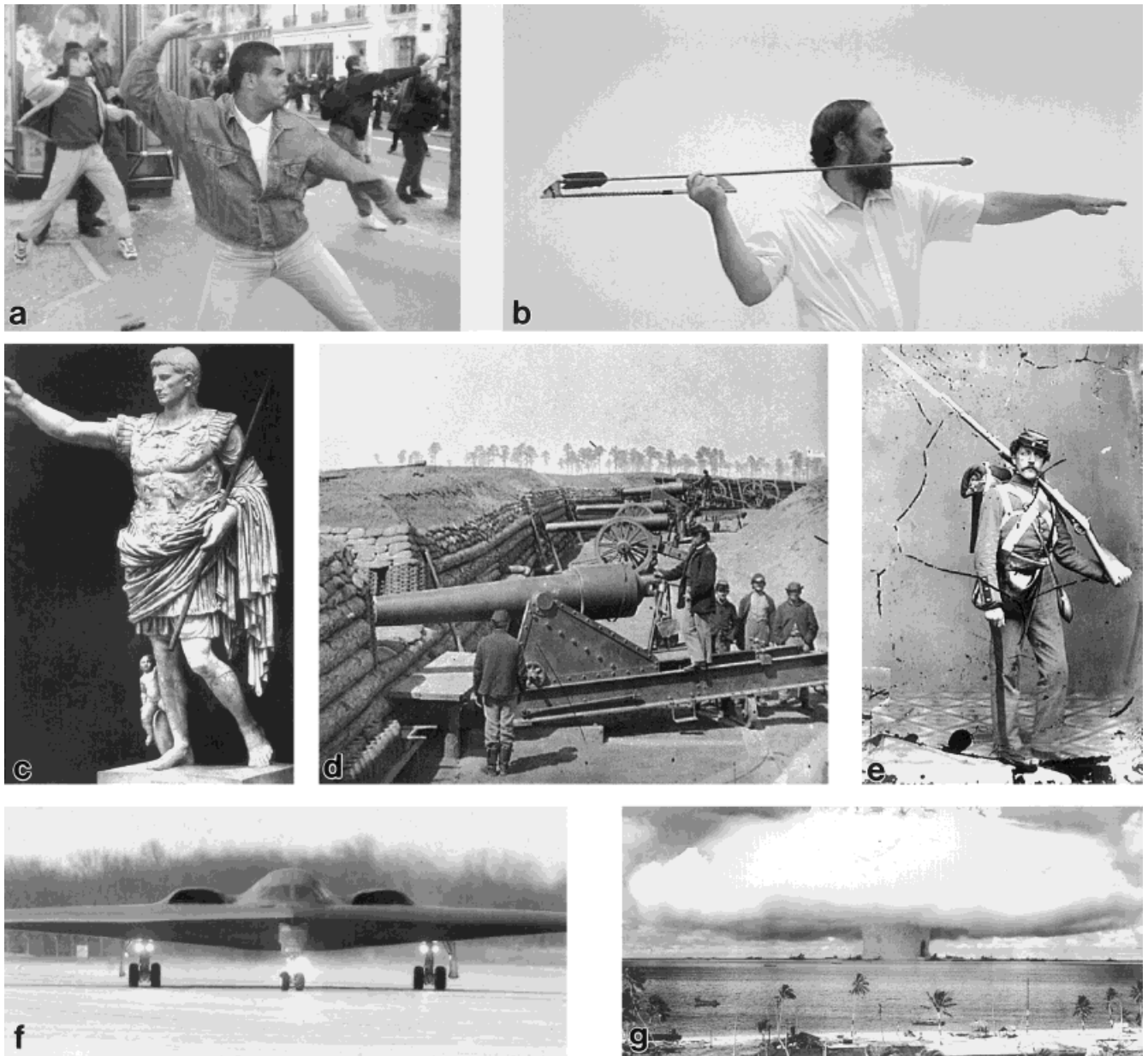
Figure 2. The evolution of distance weaponry. Distance weaponry permits the unique human adaptation of enforcement of kinship-independent social cooperation. The range and performance of these weapons limit the size and internal structure of cooperative human coalitions. Using throwing and clubbing to cooperatively project threat for purposes of enforcing confluent interests in “political” conflicts remains cross-culturally universal in contemporary humans (image a). The introduction and development of atlatls, spears, and swords characteristic of archaic states/empires (images b, c) and gunpowder weaponry (images d, e) ostensibly drove the consolidation of the modern nation-state. Further, the relationship between weaponry performance and human social structure apparently persists through the contemporary emergence of pan-global coalitions of nation-states driven by weaponry of planetary range and efficacy (images f, g). The introduction of atlatls or of advanced spears and body armor (images b, c) apparently drove various earlier changes in human coalition size and structure while gunpowder weaponry (images d, e) ostensibly drove the consolidation of the modern nation-state.